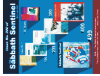
Sabbath Sentinel Magazine