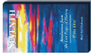
Video and Audio Tapes